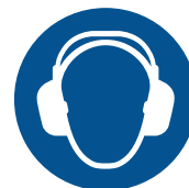
HEARING PROTECTION LOUD NOISE CLASS V PROTECTION REQUIRED