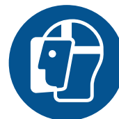
EYE & FACE PROTECTION